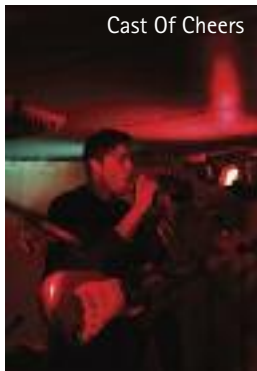
Cast Of Cheers

On Monday 5th March, we had the delight in meeting Dublin 4 Piece The Cast Of Cheers at The Louisiana, Bristol. Already 7 dates into their Nationwide tour; we met the 4 on their one date without the London based trio Theme Park when they headlined the venue joined with Casino Trap. Following a heavy night before- the Dublin