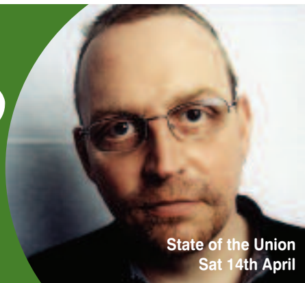
State of the Union Sat 14th April