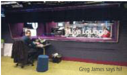
Greg James says hi!

There is more, much much more. Several musicians from this region over the past two years have taken part in the BBC's Musicians' Masterclass, a series of workshops for talented and aspiring musicians from across the country; others have taken part in live sessions recorded at the BBC's Maida Vale studios. Even if your act is perhaps not yet ready for radio play then there is a huge wealth of advice available on the BBC's website ranging from video footage of the Musicians' Masterclass to special videos on various subjects from people such as Huw Stephens. Even if you're an act in its very infancy, Introducing definitely has something for you.