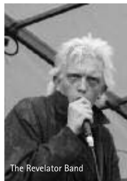
The Revelator Band

entire festival with a glorious set of rock n roll, blues, soul originals and sing-a-long standards. Back down to the Sports Field for the glorious rock groove of Willy & The Bandits , a band that lock into an inspired, original sound taking in elements of rock, blues, psychedelia, rocksteady and even Caribbean rhythms to mesmerise a packed out field (by the way, track down their album, it really captivates the group's unique vision). If that wasn't already enough the main riverside stage served up a performance that tore the place to pieces, The Revelator Band delivered a dark, almost feral take on the blues, laced it with with a dose of acidic post-punk attitude and then threw in a side order of Beefheart for a gloriously ramshackle combination of piano, spiky guitar and gruff vocals delivered theatrically by a larger than life swaggering front man that had to be seen to be truly believed. It might be blues but not as you know it.