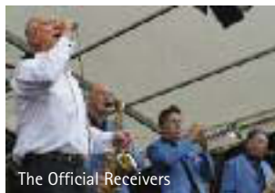
The Official Receivers

The Official Receivers appealed to the day's early revellers with their ever likeable set of big soul standards, with horns ablazing, the crowd were on their feet, swaggering, swaying and even