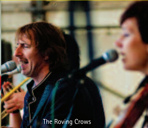
The Roving Crows